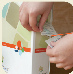
Tear at Perforated Line